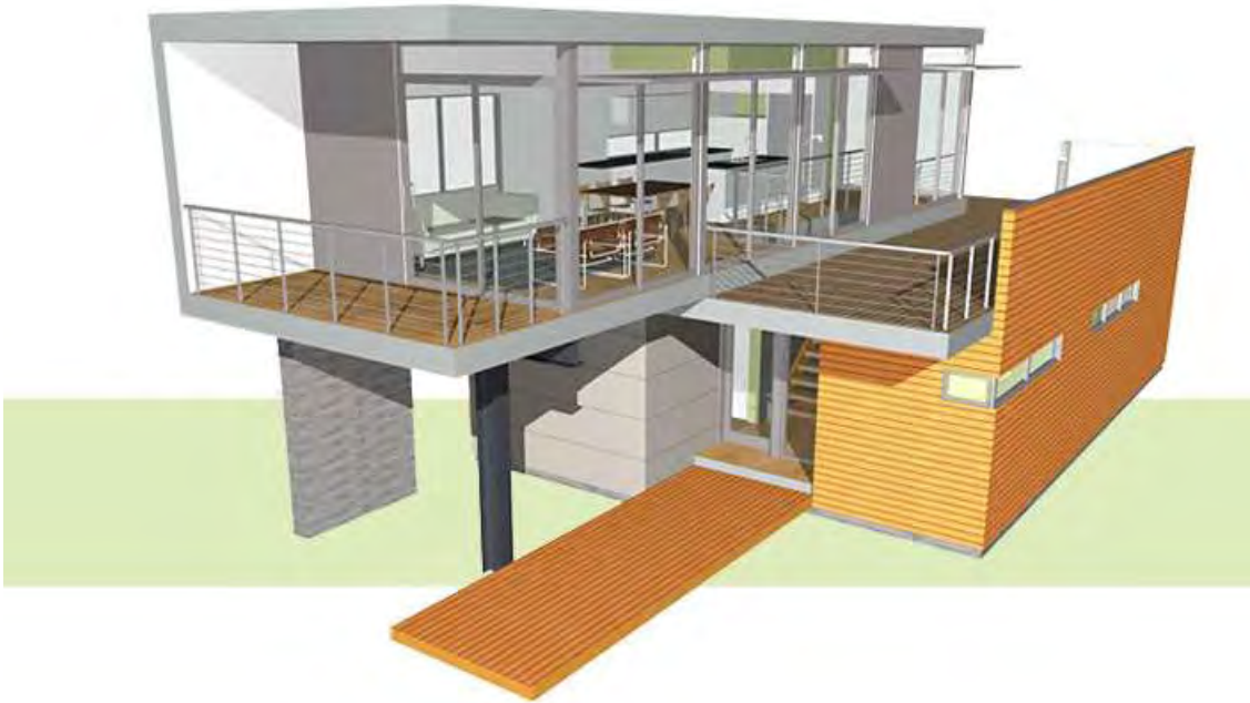
PH: BEACH WRAP

www.piecehomes.com/site/HTML/modularhomespremium.html