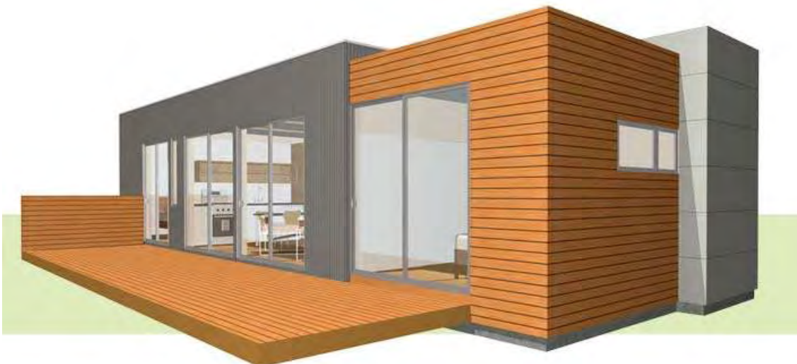
EP: GUEST HOUSE