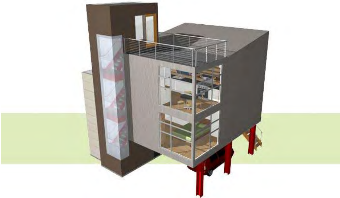
PH: CUBE HOUSE