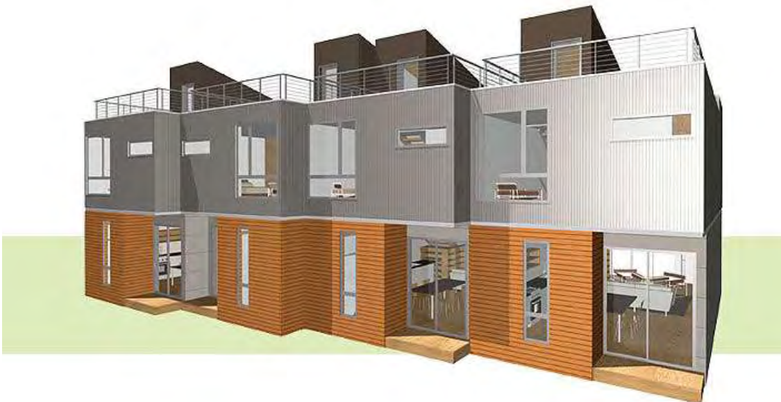
PH: TOWNHOUSE 2